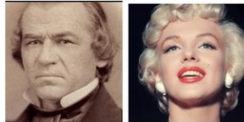
Andrew Johnson Marilyn Monroe