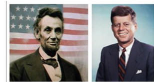
Abraham Lincoln John F. Kennedy

Abraham Lincoln was elected to Congress in 1846. John F. Kennedy was elected to Congress in 1946. Abraham Lincoln was elected President in 1860. John F. Kennedy was elected President in 1960. Both were shot on a Friday and both shot in the head. Lincoln's Secretary was named Kennedy. Kennedy's Secretary was named Lincoln. Both were succeeded by a man named Johnson. Andrew Johnson who succeeded Lincoln was born in 1808. Lyndon Johnson who succeeded Kennedy was born in 1908. John Wilkes Booth (assassinated Lincoln) was born in 1839. Lee Harvey Oswald (assassinated Kennedy) was born in 1939. Lincoln was shot at the Theatre named 'Kennedy.' Kennedy was shot in a car called 'Lincoln.' Booth ran from the theatre and was caught in a warehouse. Oswald ran from a warehouse and was caught in a theatre. Booth and Oswald were both assassinated before their trials. A week before Lincoln was shot he visited Monroe, Maryland. A week before Kennedy was shot he visited Monroe, Marilyn.